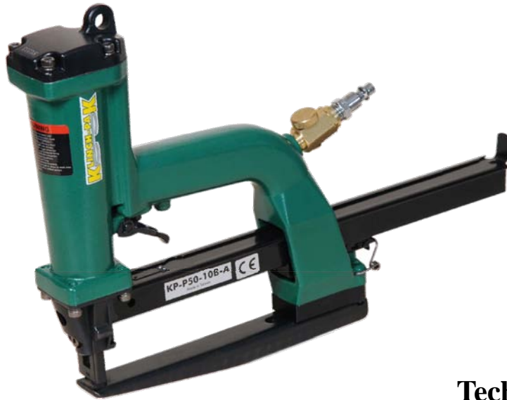
KP-P50-777 Pneumatic Plier Stapler